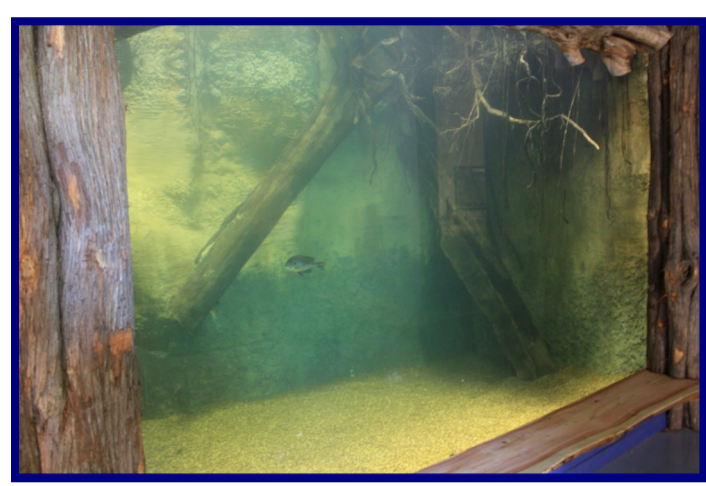
A view of the 6,000 gallon aquarium tank that houses fish native to the Pocomoke River.